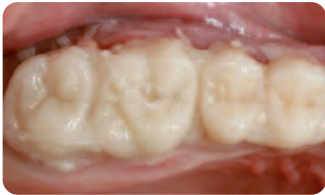
Cementation with Vivaglass CEM (Dr A. Kurbad / K. Reichel, Germany)

IPS e.max restorations are flexible with regard to their cementation requirements. Crowns and bridges can be cemented according to adhesive, self-adhesive and conventional methods. Inlays and veneers are cemented adhesively as usual.