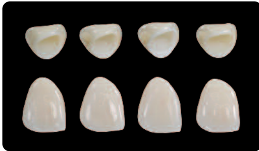
IPS e.max Ceram on four different materials (from left to right): IPS e.max Press, IPS e.max ZirPress, IPS e.max ZirCAD, IPS e.max CAD (MDT T. Michel, Germany)

You will appreciate the benefits offered by the fact that the IPS e.max system features only one layering ceramic. You can choose a suitable framework material, for example, lithium disilicate ceramic or zirconium oxide, depending on the indication to be treated and the required strength. Your dental technician will veneer all the different IPS e.max frameworks with the highly esthetic IPS e.max Ceram layering ceramic to impart the restorations with individual character and natural-looking vibrancy.