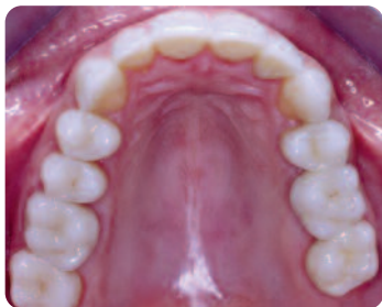
IPS e.max total restoration (Prof. Dr D. Edelhoff / O. Brix, Germany)

IPS e.max is the sum of many good ideas. The system allows you to select the most suitable all-ceramic material, depending on the indication at hand and the required strength of the restoration.