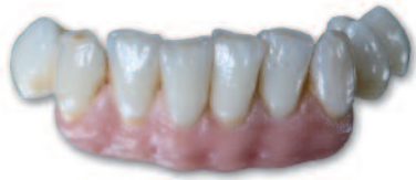
IPS e.max restoration with gingival parts (MDT T. Michel, Germany)

Irrespective of the framework material you choose, IPS e.max Ceram allows you to smoothly integrate different types of restorations. Since all the IPS e.max restorations are veneered with the same ceramic material, they exhibit the same wear properties and surface gloss. The outcome is a uniform esthetic appearance.