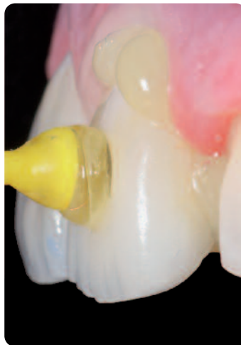
Cementation with Variolink Veneer (Dr S. Kina, Brazil / A. Bruguera, Spain)

In general, lithium disilicate (LS 2 ) is etched before it is placed. If a conventional cementation method is chosen, silanization is not required.